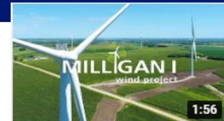
Milligan Wind Project