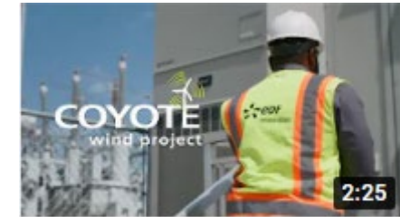
Coyote Wind Project