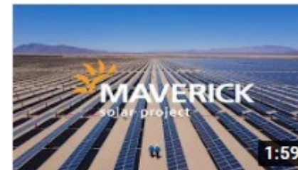
Maverick Solar Project