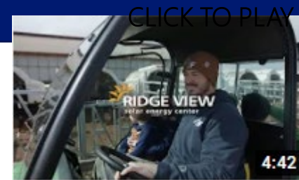
Ridge View Solar Landowner Stories