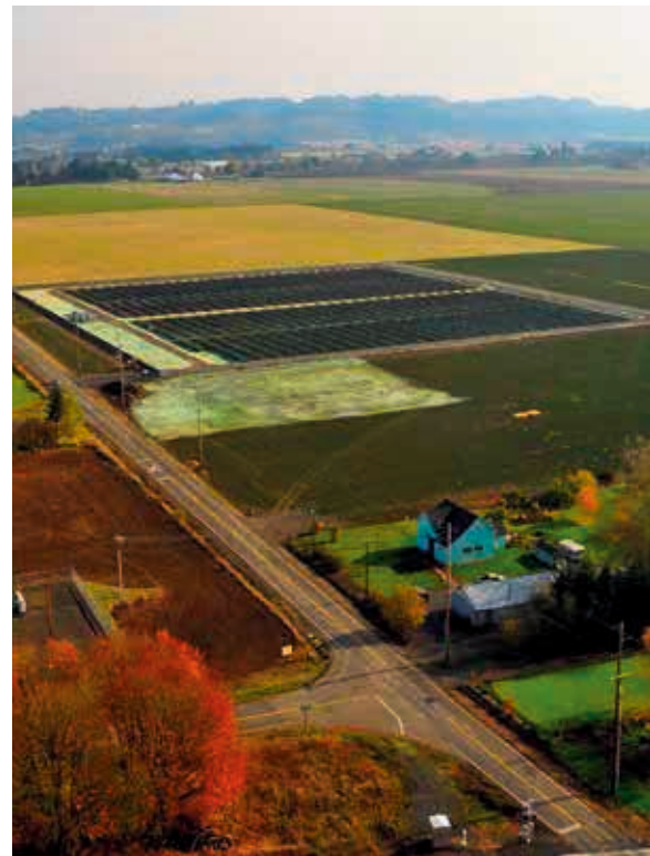
YAMHILL SOLAR PROJECT Oregon